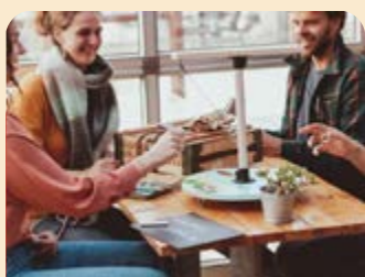
Bad weather alternative