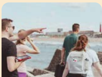
GPS tour Scheveningen