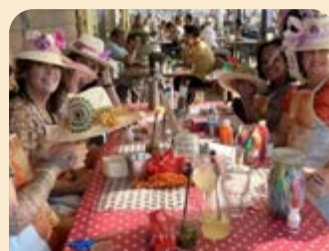
Pimp summer hat bag