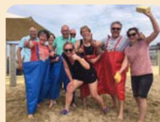
Go Hollywood games