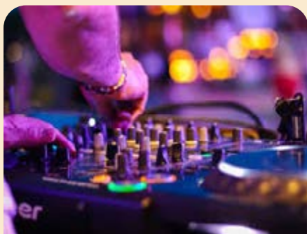
Summer DJ party

Prices are listed including and excluding VAT