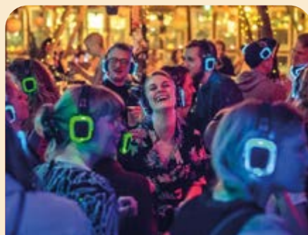
Silent or bingo disco